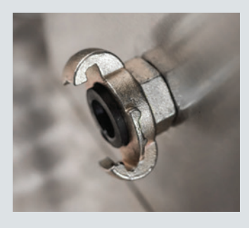
WATER SUPPLY Quick coupling allows quick and safe connection of water supply.

DOUBLE COMMANDS Commands at the both sides of the machine, positioned at the control handle. They regulate the inclination and direction of movement of the brush